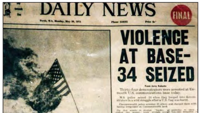
Wide spread publicity occurred during all of the “long March” activities against the NW Cape. Shown is a front page of the Perth Daily News dated Mon 20th May 1974.