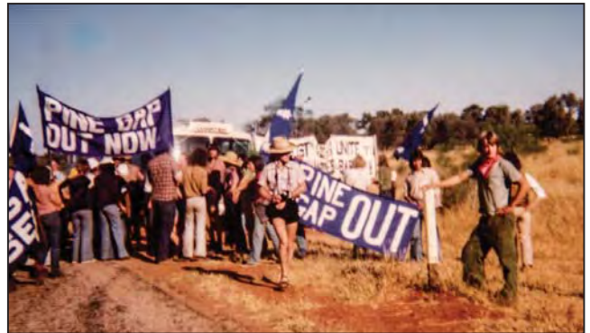
Marching to the front gate of the US CIA spy base Pine Gap.