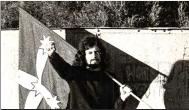
Paint-ups declaring "Independence for Australia" and "Close Down Pine Gap" were daubed on any available road - side structure on the road between Adelaide and Alice Springs.