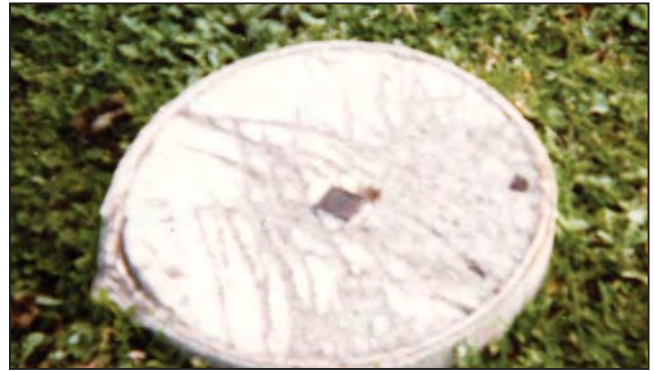
In 1977 initial works for the Omega base were discovered by CAFMBA members outside the small town of Woodside in East Gippsland