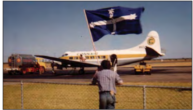
Protesting at Alice Springs Airport against the scheduled arrival of a giant US military Starlifter plane that supplies the base from the USA.