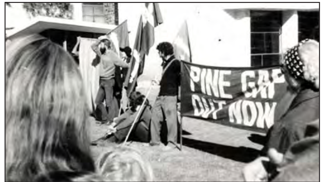
Street theatre in the main street of Alice Springs