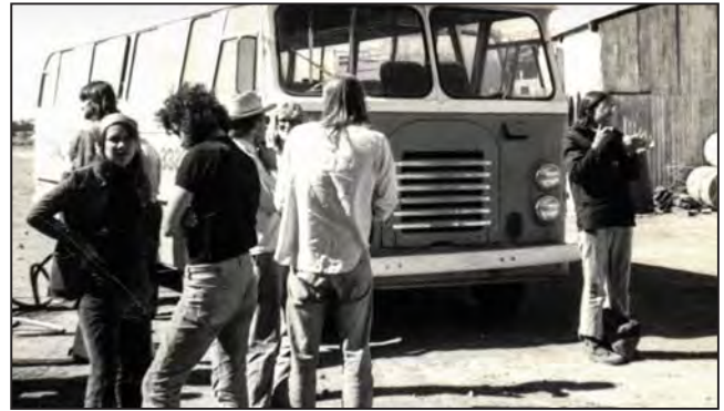
One of the hired buses used for the Pine Gap protest.