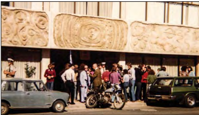
Outside Alice Springs court house in support of those arrested on the base the day before.