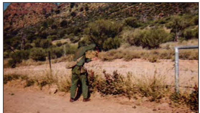
Breaking through the perimeter of Pine Gap and disappearing into the scrub