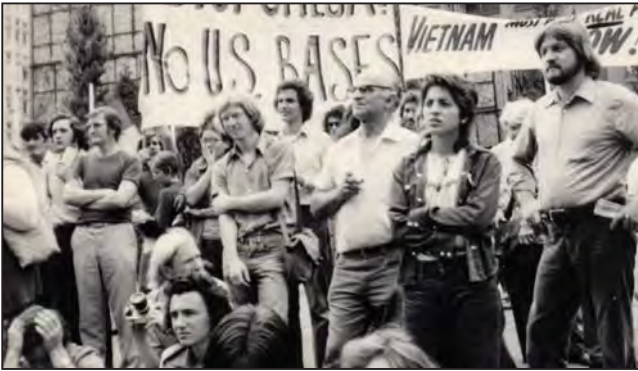
During the final years of the anti-Vietnam war movement in the early 1970's awareness of the role of US bases in Australia grew. The proposed US Navy Omega base planned for Victoria, became an issue.