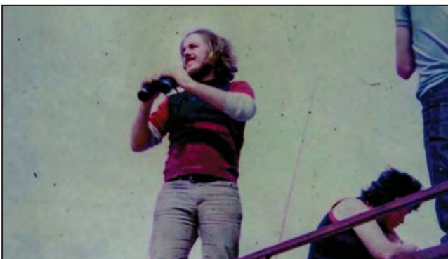
Look-outs were stationed around the caravan park camp site at Exmouth as local “red necks” had made threats.