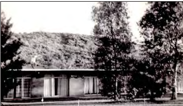
The adjacent motel to the caravan park where Commonwealth Police and ASIO spied on the protest camp.