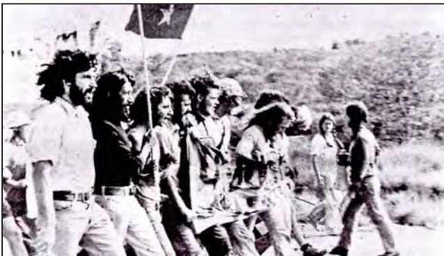
After setting up camp at the edge of the local caravan park at Exmouth, a march on the front gate of the base was quickly organised.