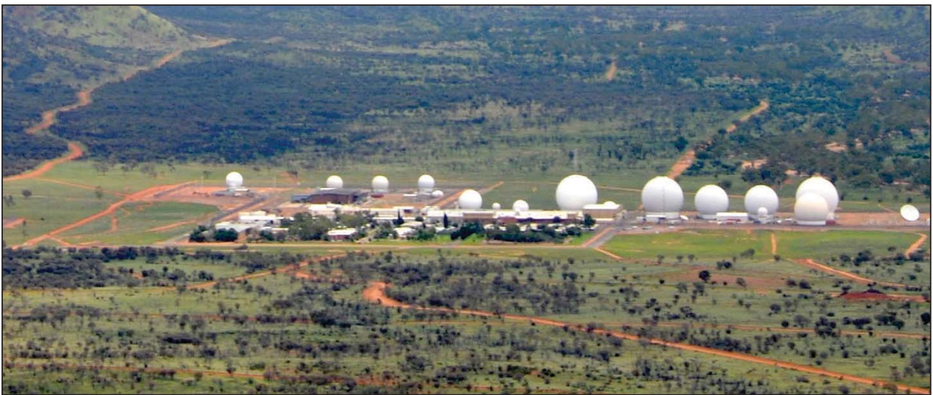
Fine Gap Today