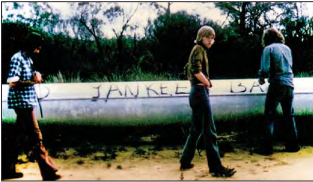
Paint - ups declaring opposition to “yankee” bases on Australian soil were done along the road to Exmouth NW Western Australia.