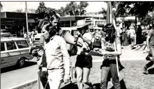
Counter protest by Country Party Senator Bernie Kilgariff using a vintage car rally.