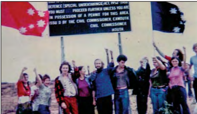
On arrival at the perimeter of the huge US North West Cape military base an impromptu rally was held in front of the first official sign sighted