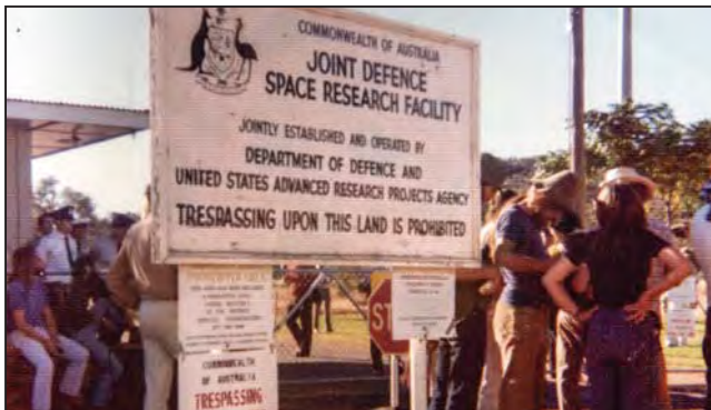
The sign outside the Pine Gap base front gate declaring the lie that it is a joint defense space research facility.