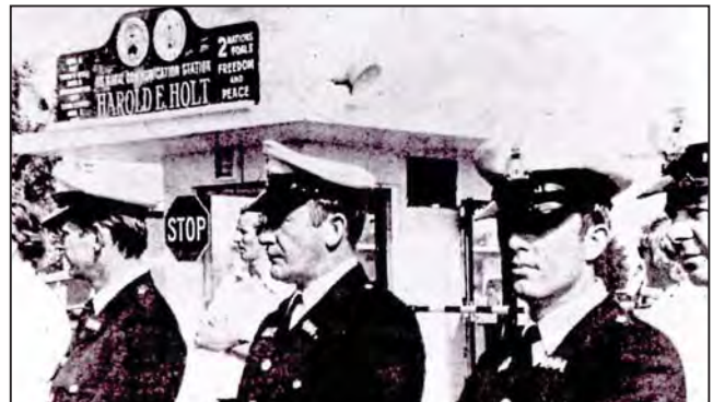
Front Gate of NW Cape base