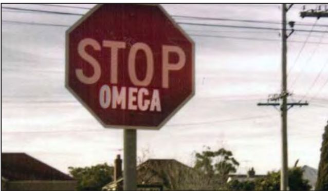
The anti-Omega campaign was highlighted in the suburbs of Melbourne using "STOP" signs.