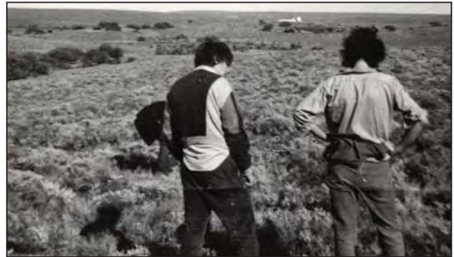
On the way back down south from Alice Springs a protest contingent visited the other top secret US military base in the area, Nurrungar 16km outside the Woomera township. A police roadblock prevented a closer inspection.

Nurrungar at the time was described as a key arms control and disarmament facility, crucial to maintaining a 'balance' between the superpowers. But there was no denying it enhanced the US's war – fighting abilities and therefore added to increasing global instability, making it also a nuclear target like NW Cape and Pine Gap.