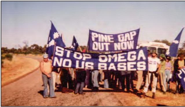
Marching to the front gate of the US CIA spy base Pine Gap.