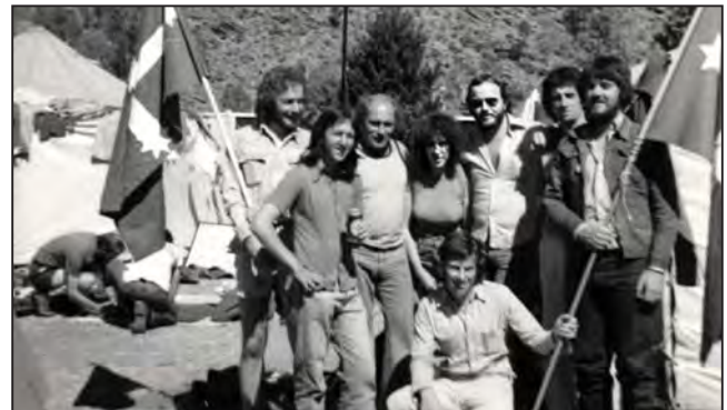
Some of the anti-Pine Gap activists at the Heavitree Gap caravan park on the outskirts of Alice Springs.