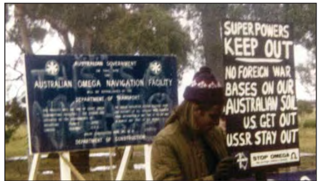
In 1978 a number of protests were held outside the Omega construction site and in the nearest major town of Sale.