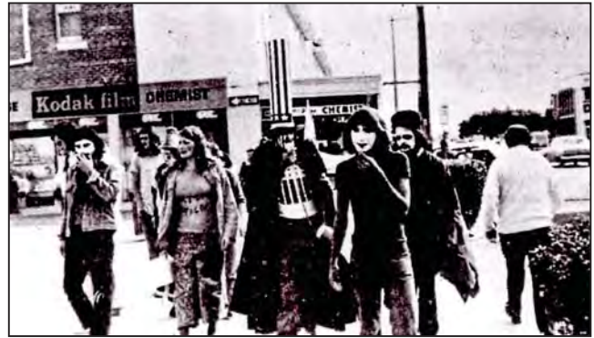
Street theatre in Perth attracted vicious police attacks.