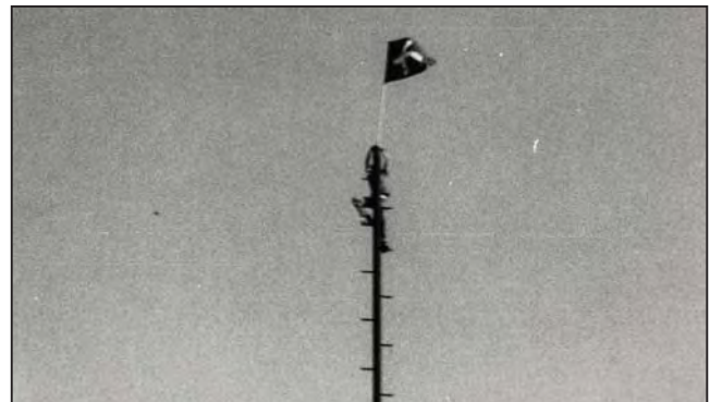
Ed Dyker flag penetration