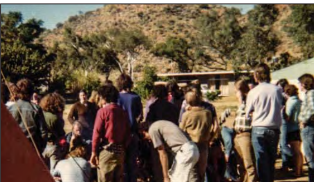
A strategy meeting at the Heavitree Gap caravan park before heading off to the Pine Gap base 20 km from Alice Springs.