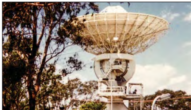
US Navy dish

The local suburbs, including Watsonia, were leafleted. The material highlighted the nuclear status of the new base and emphasised it was just another cog in the massive US military presence on Australian soil.