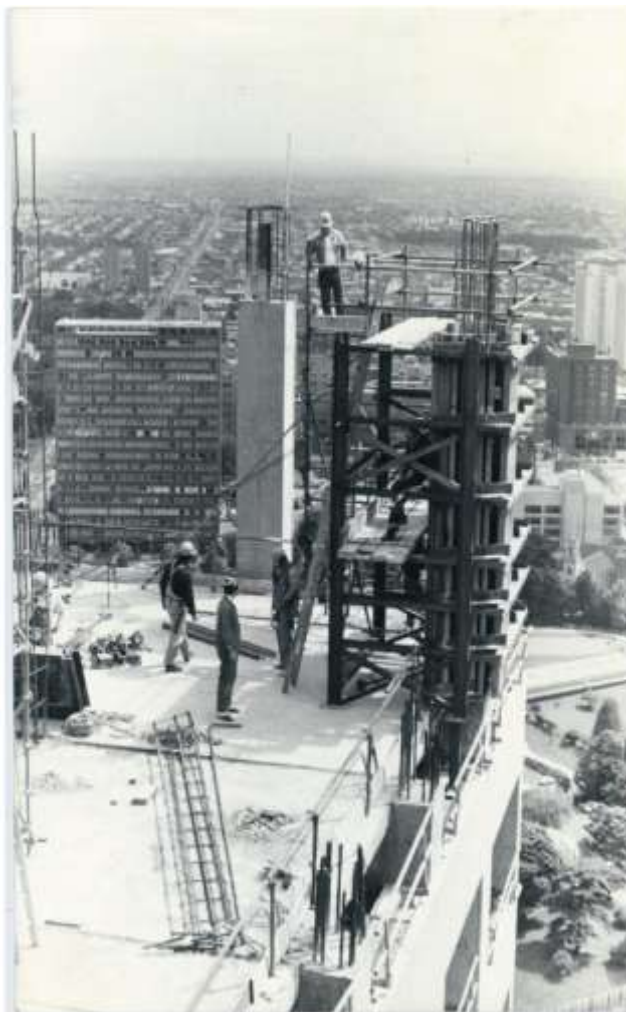
Going Up! Just as the skyline began to lift

Portability of long service leave was won by the construction unions in 1976 after a vigorous campaign over many years .Prior to this very few construction workers enjoyed long service leave because they very rarely could accumulate sufficient time with the one employer. Now employers contribute to a central fund that pays for an employee's long service as it accumulates in the industry, not just with one employer. 1)