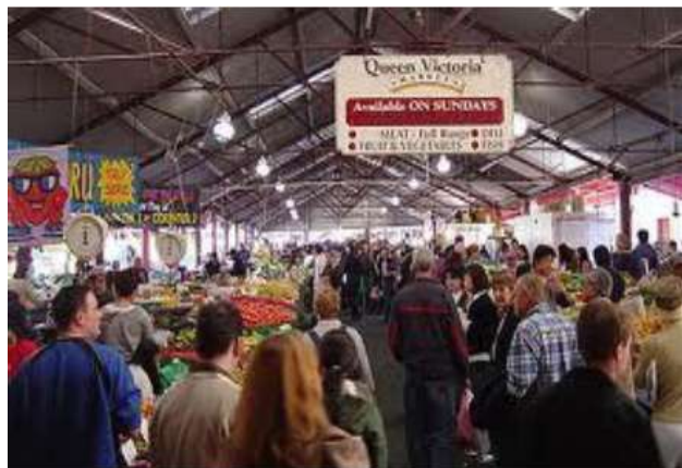
Fig 5: Vic Market, Community Market

period, and who are proud of the Green Ban. Since those days, through the seventies, eighties until now, many of us have all met, discussed politics, found jobs and shopped at the Vic Market every Saturday. Our community is there;