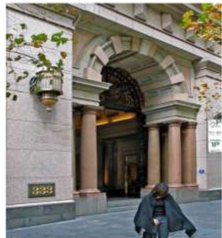
Fig 10: 333 Collins

When those others attempted to demolish, it was it saved by workers, members of the BLF and led by Norm Gallagher.