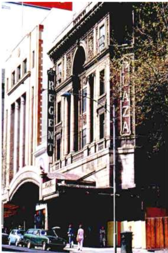
Fig 12: Regent when Green Ban was applied

In other words the Green Bans raised the question of power within the economy. Unions in the past maintained that wherever power is at issue, then the resolution to the issue must be democratic. Where it is not, and unequal laws apply, then workers, the vast majority, reserve the right to strike.