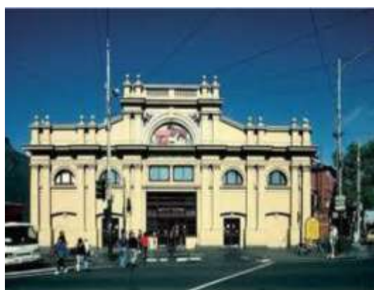
Fig 3: Victoria Market