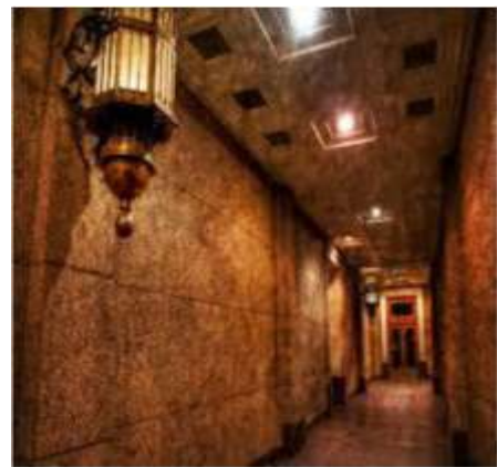
Fig 8: 333 Collins St

support for its regeneration. 333 Collins St was built by workers and owned by others. The wealth within its Commonwealth Bank of Australia walls was created by workers but owned by others. When those others attempted to demolish, it was it saved by workers, members of the BLF and led by Norm Gallagher.