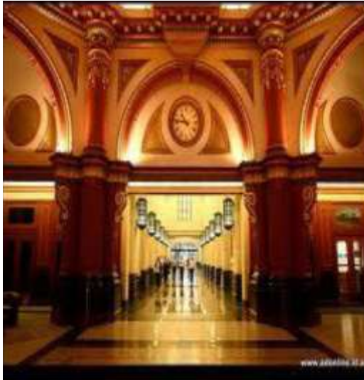
Fig 7: 333 Collins St

Sometimes the site of Green Bans involved places thought to be related to the centres of privilege. Banks and artistic pursuits that in times before the 1970's not many workers could afford to engage with, for example. At 333 Collins Street "The crossed rib dome inspired by Italian Baroque and Moorish precedents, is considered one of the great Victorian era interiors of Melbourne, and was narrowly saved from demolition in the 1970s following public opposition led by the National Trust. It was built for the Commercial Bank of Australia, and completed just as the 1880s financial boom collapsed – the bank had to close its ornate cast iron gates in April 1893 for a time to keep out desperate depositors at the height of the crisis. The original façade of the building was refaced in 1939, in turn replaced by the current podium level stone façade, the central section of which is a simplified version of the 1893 original." (3) Number 333 Collins St in the heart of Melbourne's financial district in the 1880's when it was built, remains so today. However, and once again, if you went by comments quoted above we are asked to believe that the National trust led the opposition to its destruction and