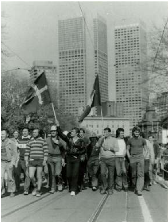
The BLF street marches in the 1970's stopped jobs to increase political pressure