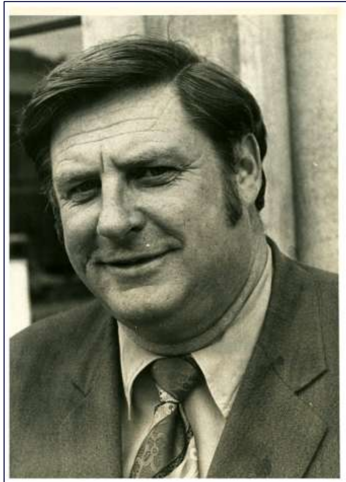
Norm Gallagher, an important leader of the BLF and the Australian Labour Movement