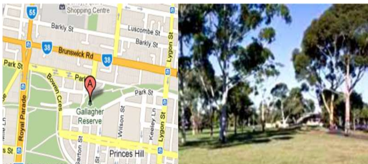
Fig 2: Gallagher Reserve Solly Ave Princes Hill Carlton