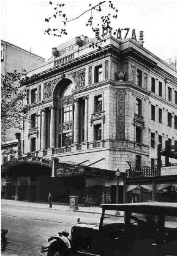
Fig 11: Original Regent

“It was a team effort, and only teams win premierships. Dedication, discipline I think that it was a team effort. The union got its encouragement from the ...people...They, in turn, got encouragement from the union. So it was a team effort.”- Norm Gallagher. (ibid)