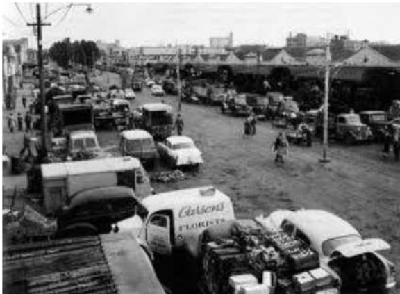
Fig 4: Vic Market 1950's