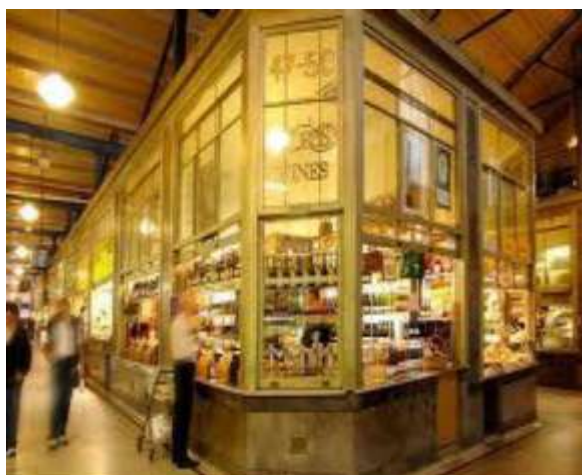
Fig 6: Vic Market – Green Bans build on past

As With other parts of Melbourne's history that were saved by the BLF, it would indeed be appropriate for an historical plaque to be placed at the Victoria Market that records the role of Norm Gallagher and the BLF in saving the site for posterity.