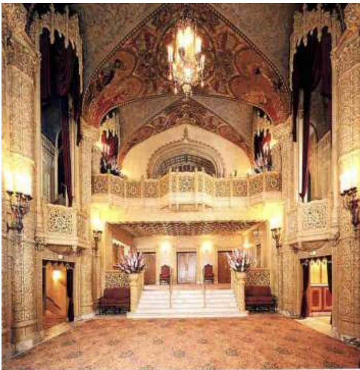
Fig 13: Regent today, a successful Green Ban

The protests that resulted from the planned demolition and redevelopment of the Regent also included an important approach to the Builders Labourers’ Federation for help in stopping the redevelopment. The ban subsequently placed on demolition of the Regent by Norm Gallagher and the BLF was the main factor that saved the theatre from destruction. After remaining empty for 20 years, the Regent was restored to its former glory and was reopened as a live theatre in 1996. The Regent Theatre is today regarded a cultural asset for the City of Melbourne and is now protected by the National Trust and Victorian Heritage listing.